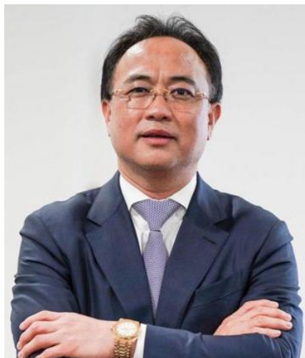
Neak Oknha KITH MENG Chairman